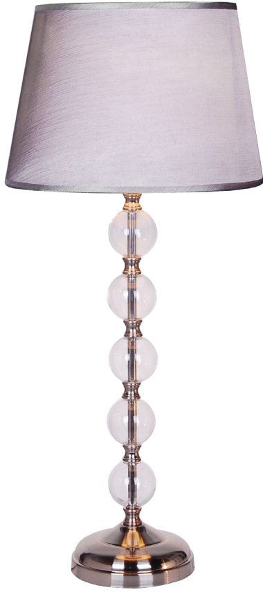
14353 with light